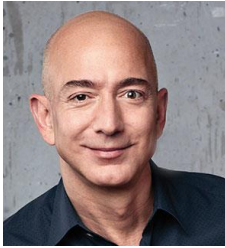
Jeff Bezos, Amazon